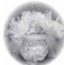
Bridal Bouquet $4.00 Each