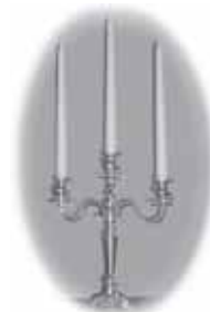
3-Tiered Candle $7.00 each