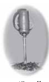
w/Candle $4.00 each