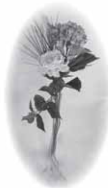
Seasonal Flowers $5.00 each